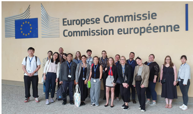
Graduate School of Education students at the European Commission in Brussels, Belgium.